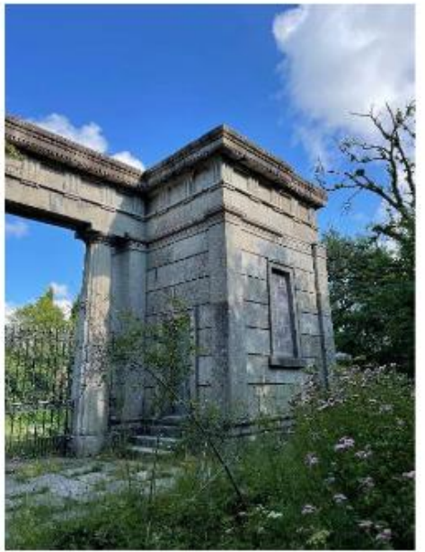
Granite Lodge / Gatehouse