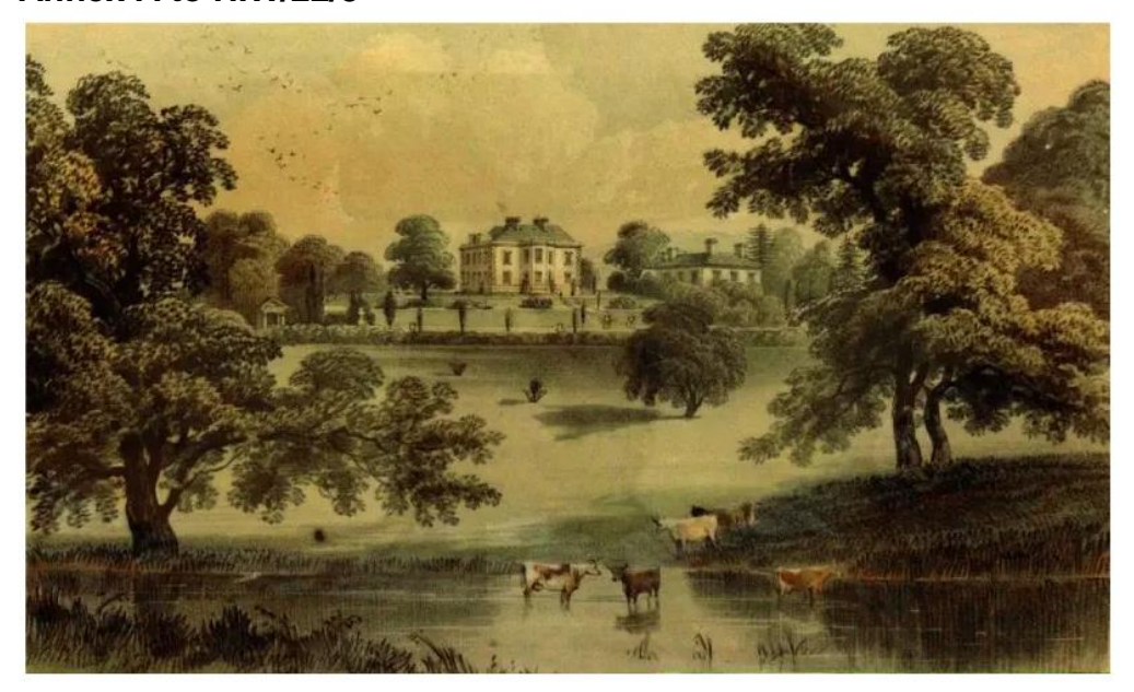
Former Serpentine Lake